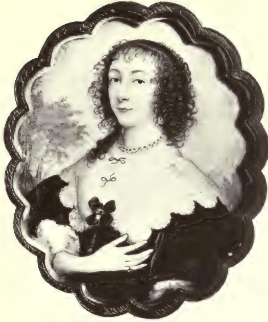
QUEEN HENRIETTA MARIA BY JOHN HOSKINS, THE ELDER